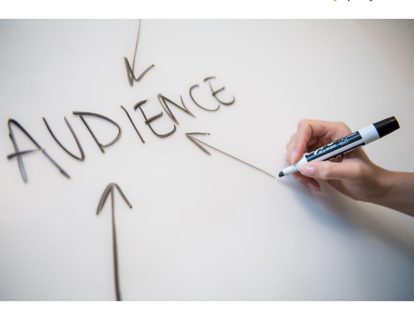
September 2022 Newsletter